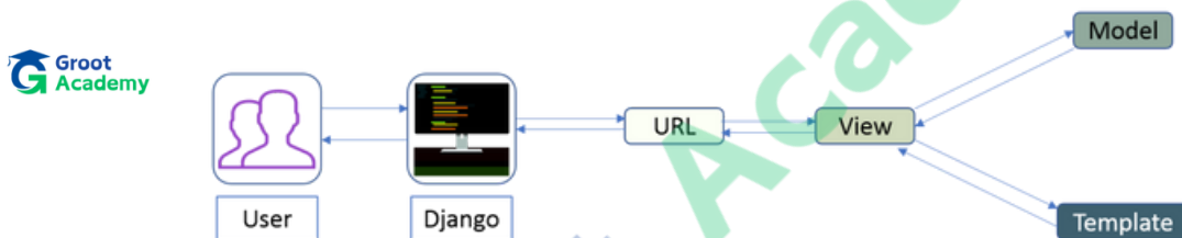
Figure: Python Interview Questions

The developer provides the Model, the view and the template then just maps it to a URL and Django does the magic to serve it to the user.